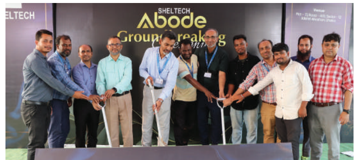
Ground Breaking of Sheltech Abode

The ceremonies were graced by the Senior Officials, Architects, and Engineers of Sheltech (Pvt.) Ltd. as well as respected landowners of the projects. Sheltech Abode is situated at Sector-12 where as Sheltech Rahman's Retreat is situated at Sector-16 in Jolshiri abashon, Dhaka. Both the projects are offering 9-storied (G+Mezzanine+8) residential building with 08 single units 4 bed-room apartments. Sales are currently ongoing for these beautiful projects. Call our sales hotline at 16550 to learn more!