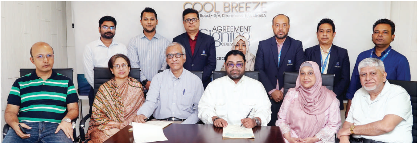
Agreement Signing Ceremony of Sheltech Cool Breeze at Dhanmondi 9/A

Sheltech Cool Breeze presents a 13-storey residential building with 22 exclusive apartments, offering a calm and serene living environment in one of Dhaka's most prestigious neighborhoods-Dhanmondi. With a well-connected road network across Dhaka and essential civic amenities such as hospitals, schools, and colleges within walking distance, Sheltech Cool Breeze ensures unmatched convenience to its residents. This project promises to be the gateway to premium urban living for discerning apartment owners. For more information about the project, please contact our sales hotline at 16550 .