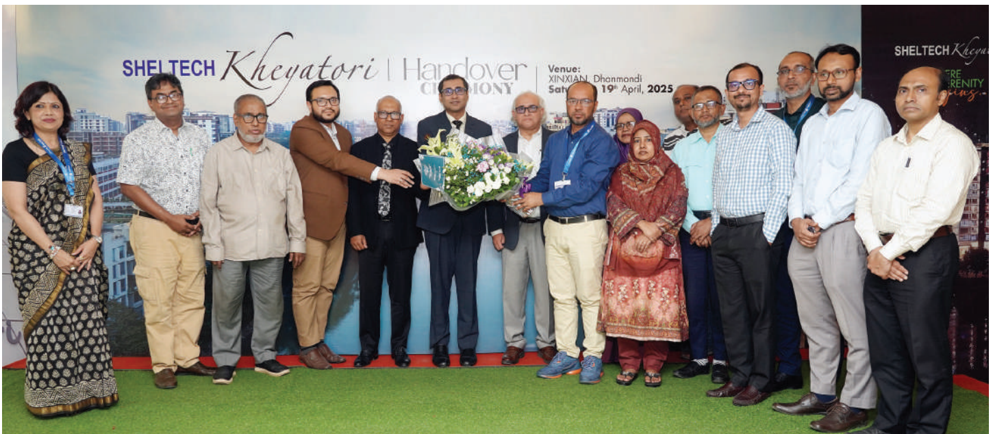
Handover Ceremony of Sheltech Kheyatori at Gulshan Lake Drive Road on April 19, 2025