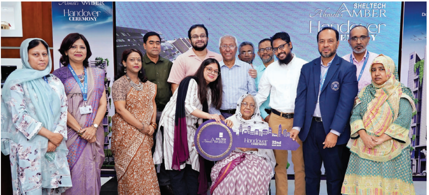
Handover Ceremony of Sheltech Ahmed's Amber at West Dhanmondi on March 22, 2025