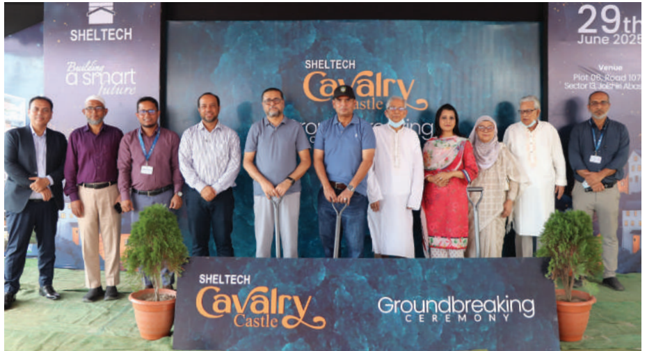
Ground Breaking Ceremony of Sheltech Cavalry Castle

These new developments continue Sheltech's commitment to quality, timely delivery, and elegant, sustainable design in one of Dhaka's most promising residential zones.