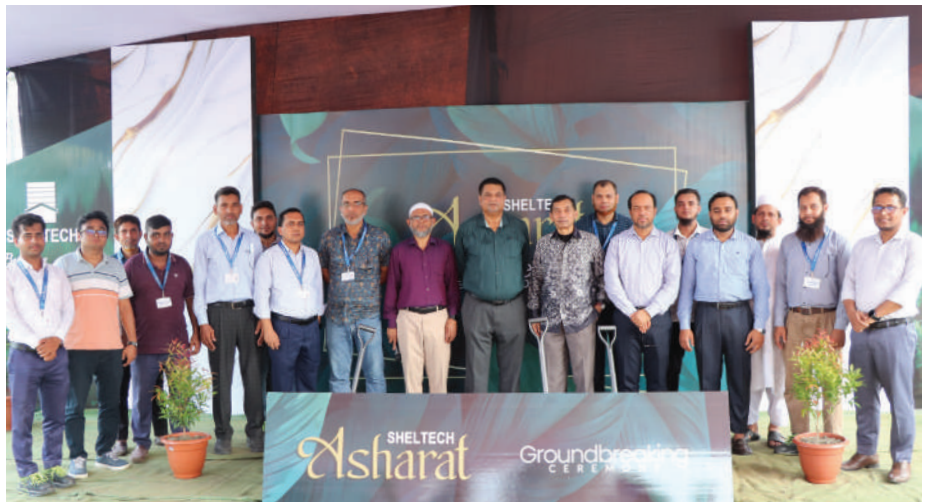
Ground Breaking Ceremony of Sheltech Asharat