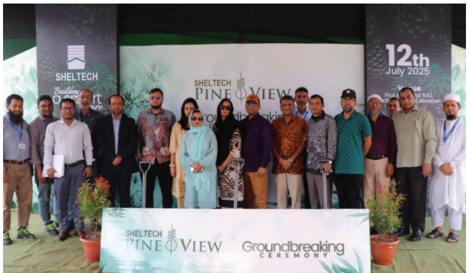
Ground Breaking Ceremony of Sheltech Pine View