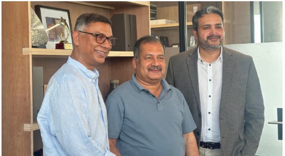
Signing Ceremony of Sheltech Dahlia in Banani

Another project was signed on November 09, 2025, for Sheltech Dahlia in Banani, one of Dhaka's finest residential areas. The project will feature a 9-storied (G+8) residential building with 8 single-unit apartments (approx. 2100 sft.) over a land area of 5.83 katha.