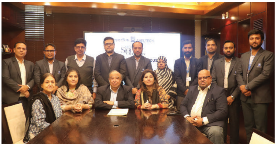
Signing Ceremony of Sheltech Rajshahi House in Boro Maghbazar

On December 21, 2025, Sheltech signed another project named Sheltech Rajshahi House in Boro Maghbazar, Dhaka. This residential project will feature a 14-storied (B+G+13) building over a land area of 20.44 katha. There will be a total of 40 apartments of 733-2200 sft. (approx.) including 38 parking spaces in the project.