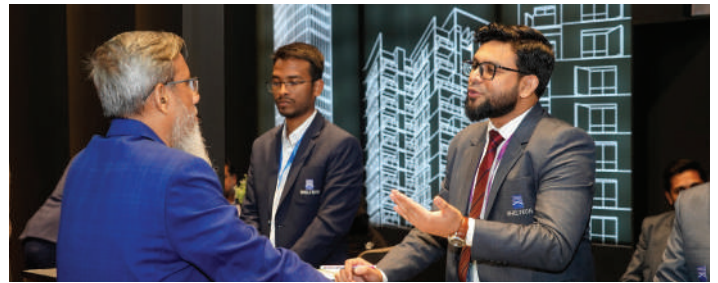
Sheltech Management, High Officials, and the Dynamic Sales Team at Sheltech Stall in the REHAB Fair 2025