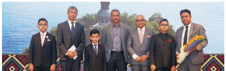
Celebration Ceremony of 50 years of Timor-Leste's Proclamation of Independence