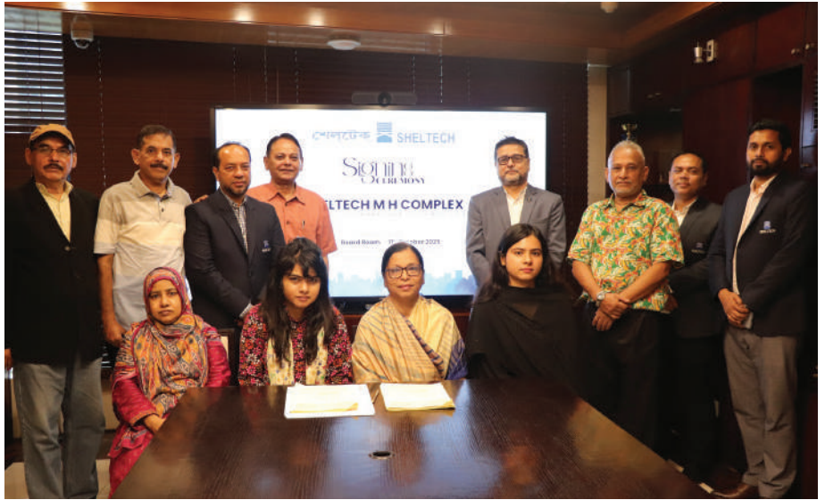
Signing Ceremony of Sheltech MH Complex in Joar Shahara

On October 06, 2025, Sheltech signed a project named Sheltech MH Complex , located in Joar Shahara, Dhaka. The 10-storied (B+G+9) mixed-use building will span 18.18 katha of land, comprising 60 units (40 residential apartments and 20 commercial spaces), including 40 parking spaces. The sizes of the residential apartments will be 1340 sft., and commercial spaces will range from 230 to 575 sft.