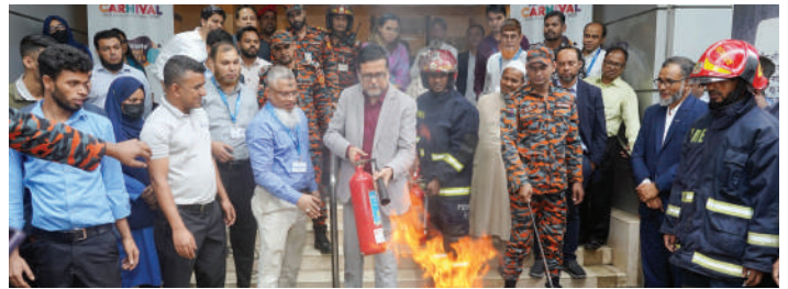
Sheltech Management and Employees are Actively Participating in the Fire Drill