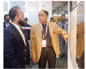
Sheltech Top Management, High Officials, Delegates, and Clients Visiting Sheltech Stall at the Ceramic Expo