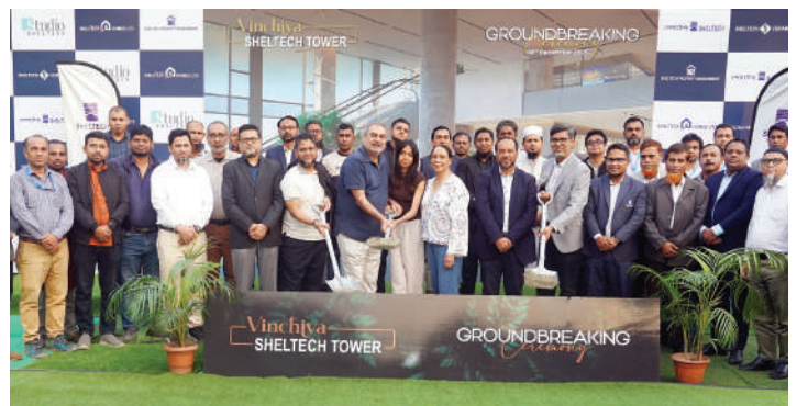
Groundbreaking Ceremony of Vinchiya Sheltech Tower in Tejgaon Industrial Area, Dhaka