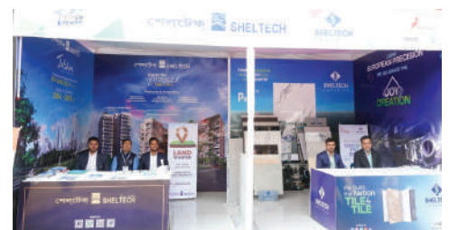
Sheltech Officials and the Participants at the Dhanmondi Society Fair & Cultural Program 2025