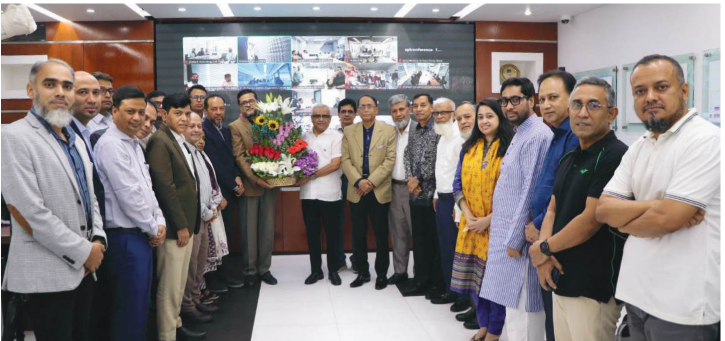
Sheltech Board of Directors and Officials at the Celebration Ceremony