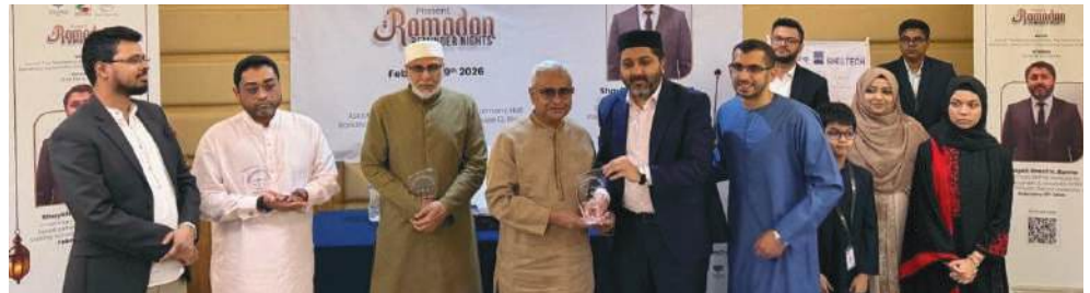
Participants at the Ramadan Reminder Nights