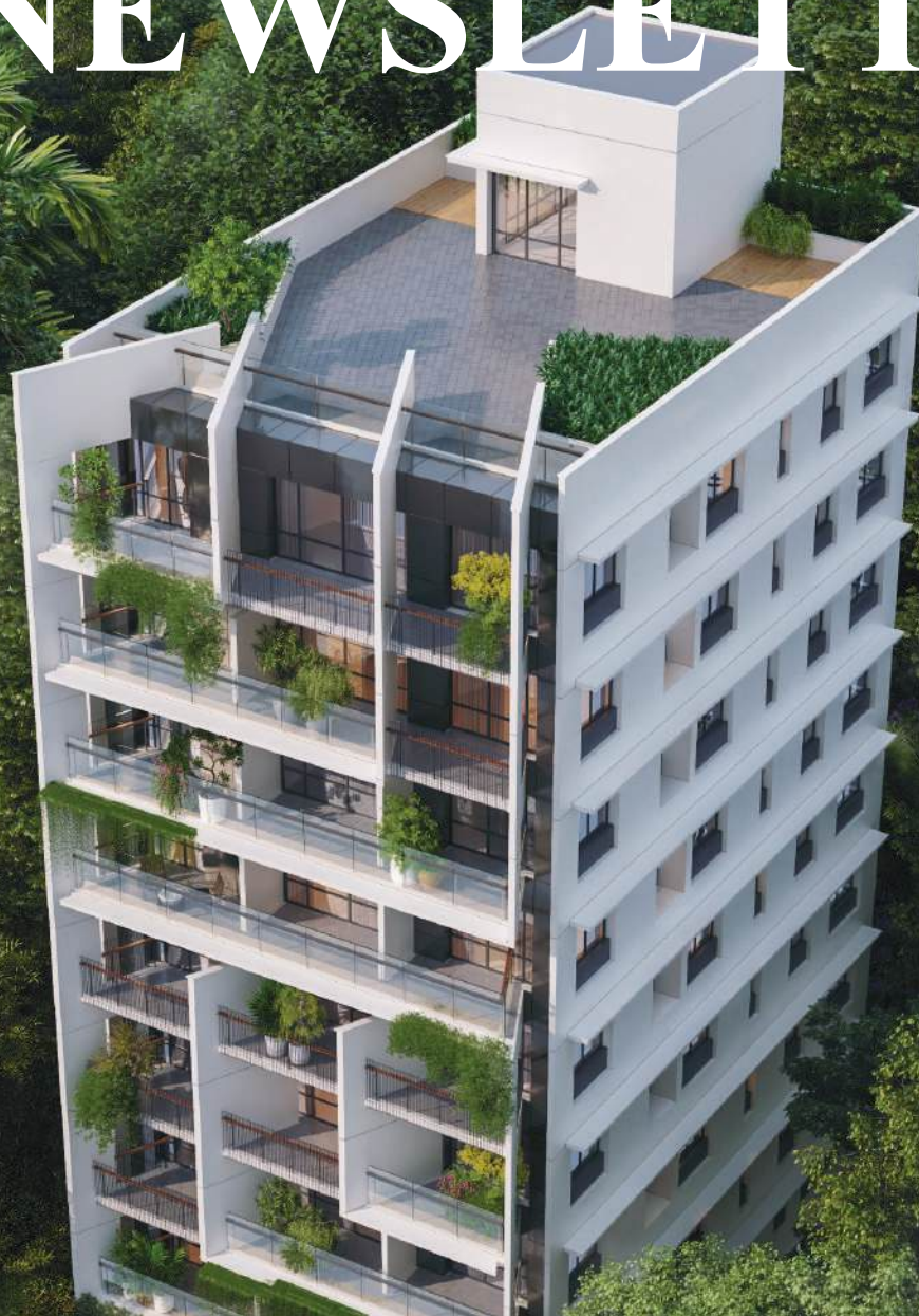
Golf Vista Sector-17, Jolshiri Abashon