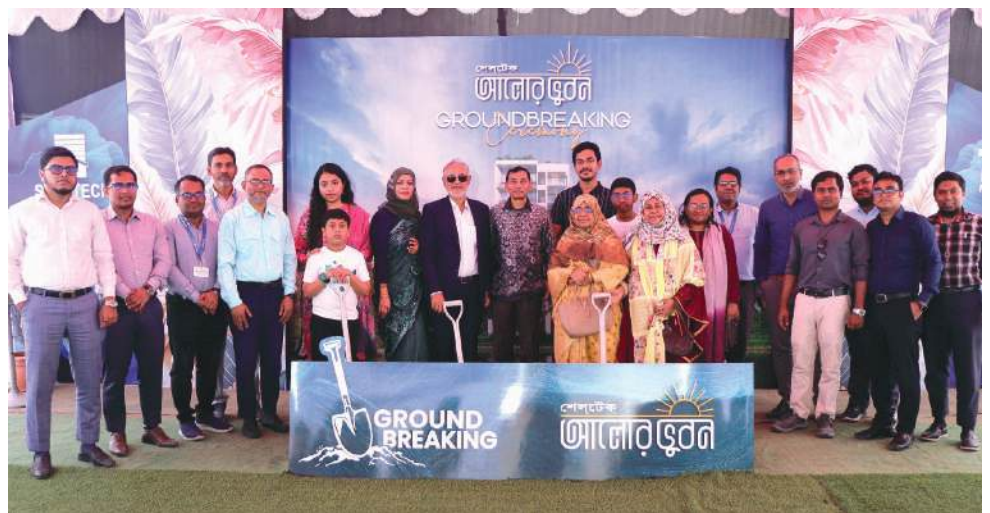
Groundbreaking Ceremony of Sheltech Alor Bhubon