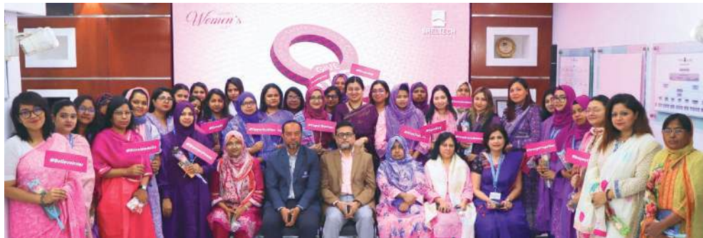
Breaking Barriers, Building Dreams- Celebrating the Women Who Make Sheltech Stronger!

On the International Women's Day (March 08, 2026), Sheltech (Pvt.) Ltd. proudly honors the incredible women who play vital roles in its success. This special occasion was marked by heartfelt stories shared by female employees of Sheltech (Pvt.) Ltd., highlighting their journeys, challenges, and triumphs. Their resilience and dedication continue to inspire us all to push boundaries, break barriers, and create a more inclusive future. At Sheltech, we remain committed to empowering women and fostering a workplace where talent and ambition know no limits.