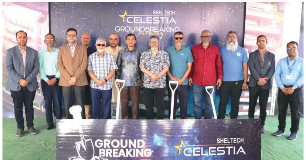
Groundbreaking Ceremony of Sheltech Celestia