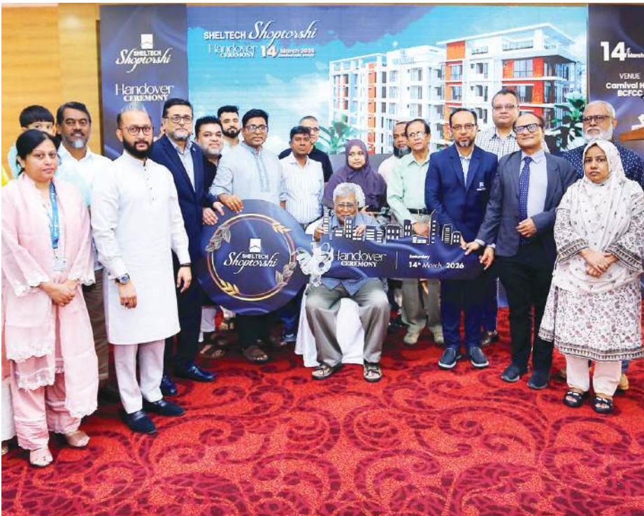
Handover Ceremony of Sheltech Shoptorshi