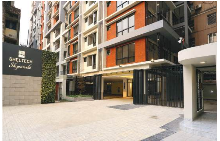
Sheltech Shoptorshi at West Panthapath