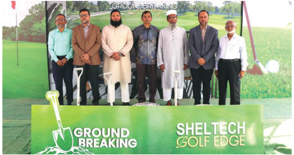
Groundbreaking Ceremony of Sheltech Golf Edge